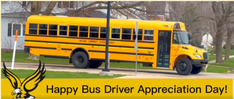
Happy Bus Driver Appreciation Day!

We have 10 bus/car drivers and a few substitutes. Thanks to all for keeping us safe!