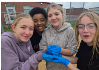
6th Grade School Clean-Up Day!

WHO had a great time at our K-3 Spring Concert "It's a Hit" last week? We appreciate everyone who came out to support our music program!