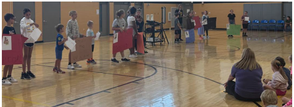
Student Lighthouse team leading a matching game to review our Habits during the September assembly.